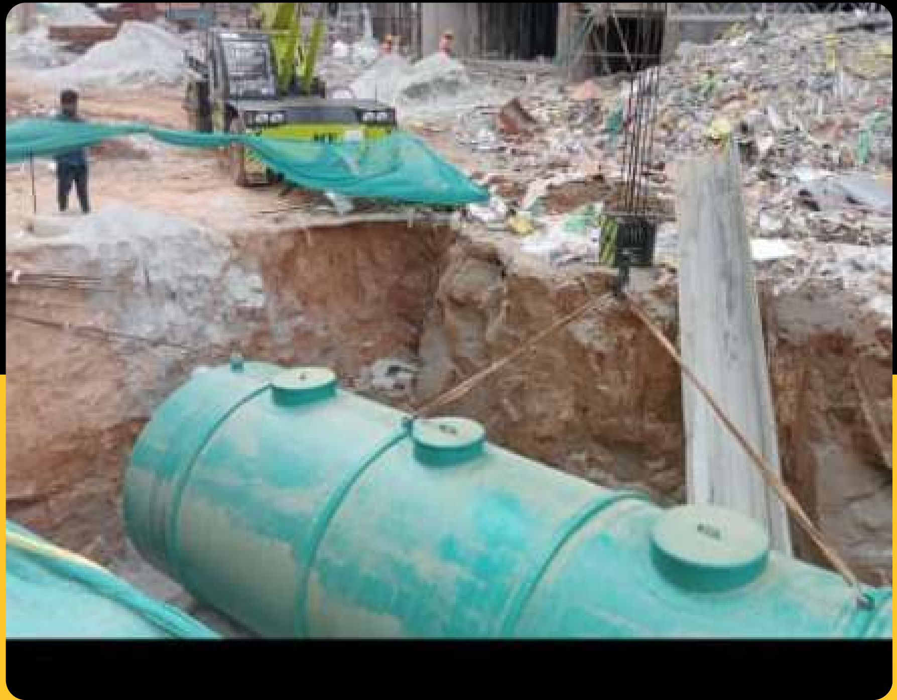
Bio septic tank installation work