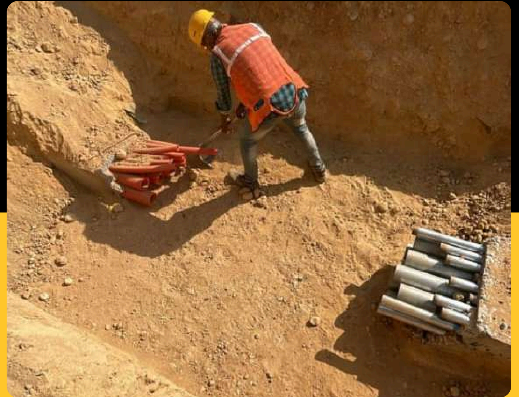
Main electric line chamber soil removing and levelling work