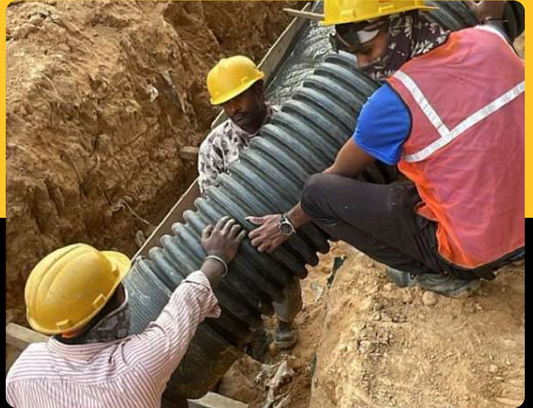
Pipe line encasing work