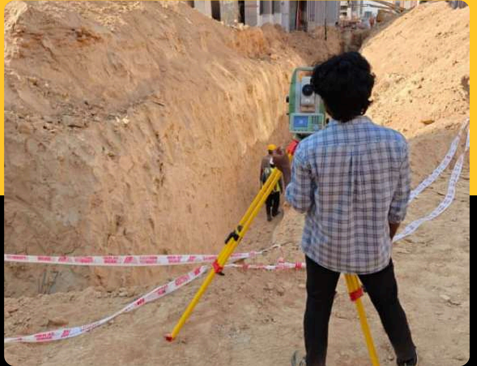
Marking chamber points and elevations from surveyor