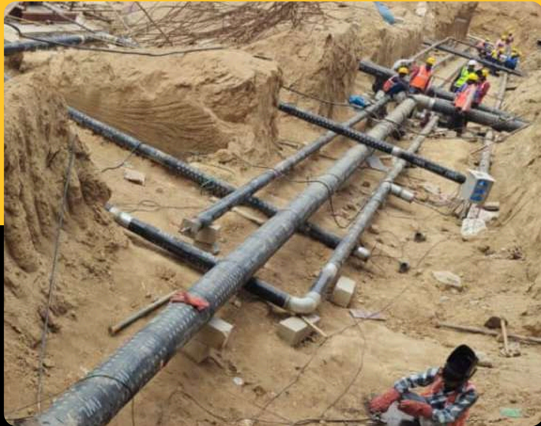
Electric main line welding work