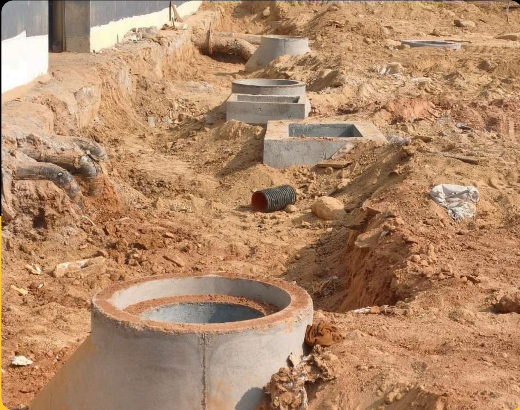
Chamber installation completion work