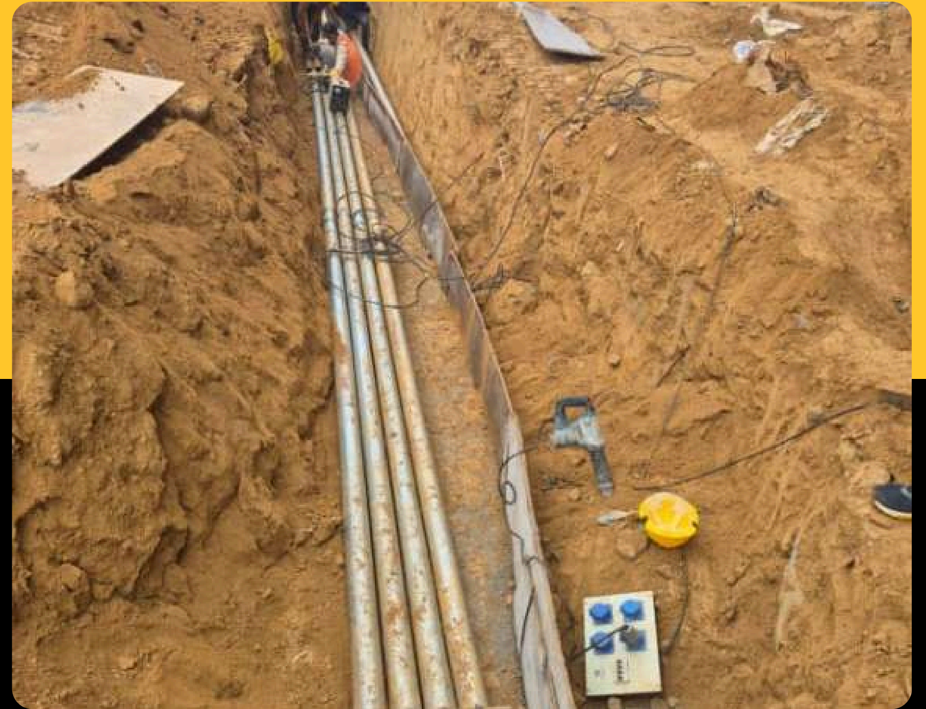
Street light and garden light pipeline work