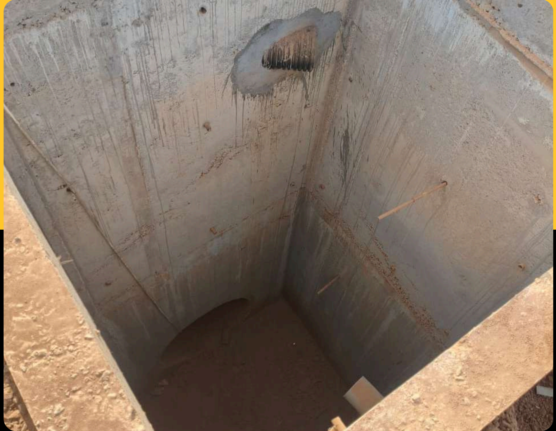
Main drain header