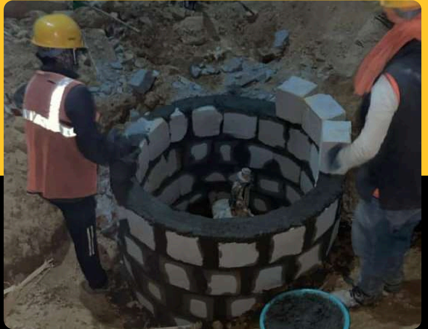
Round shape gate valve solid brick chamber work