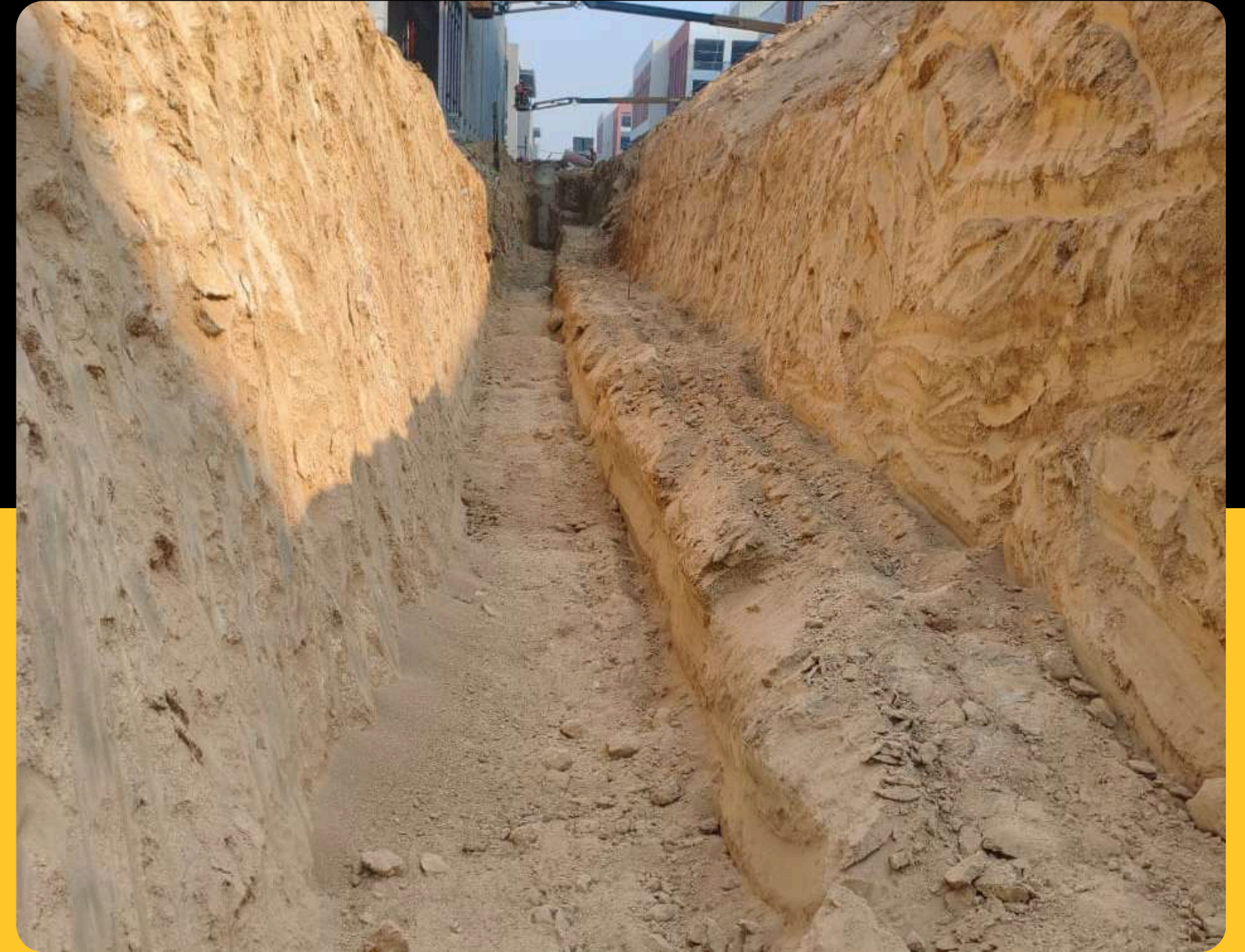
Camper point marking work