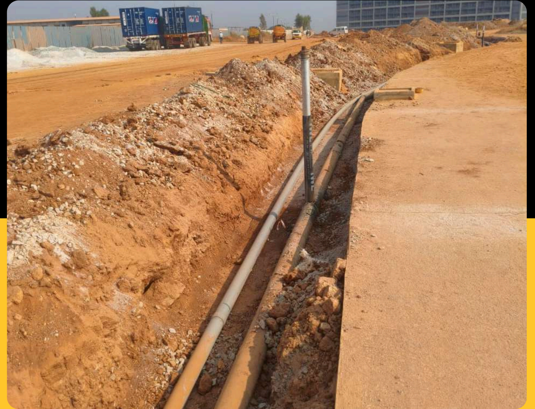
Fire hydrant pole