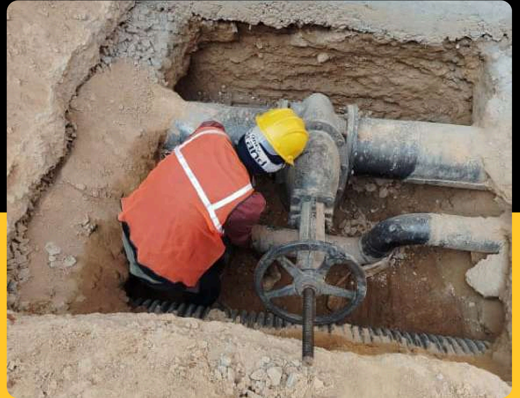
300 mm gate valve tightening work