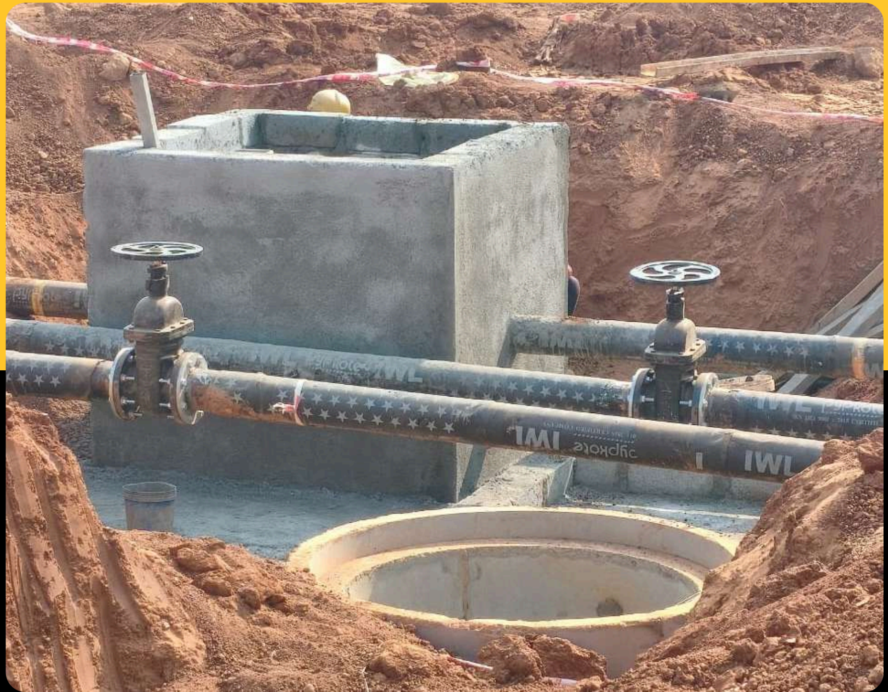
Water line gate valve installation work