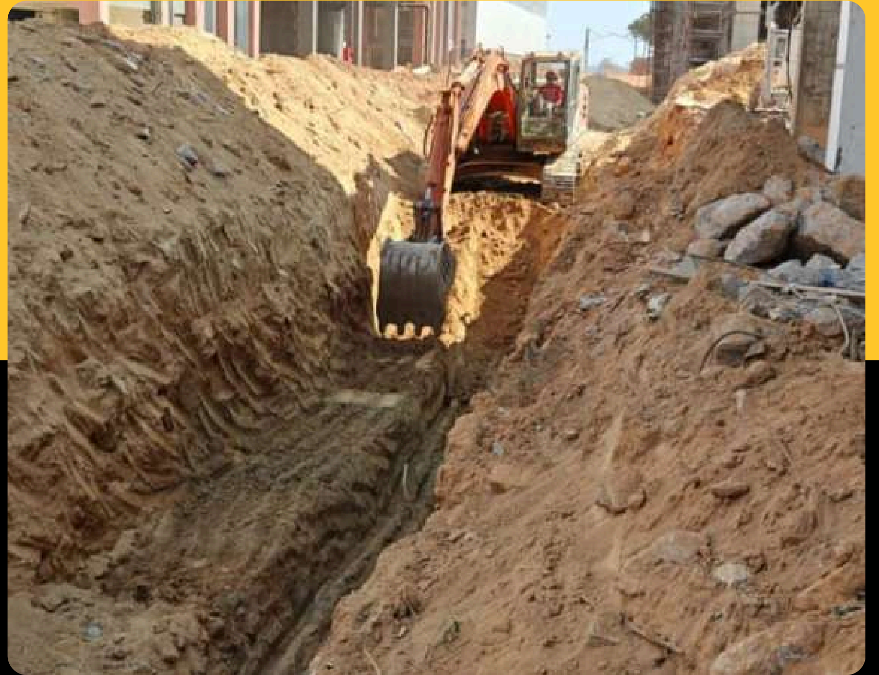
Sewer and rain water chamber excavation work