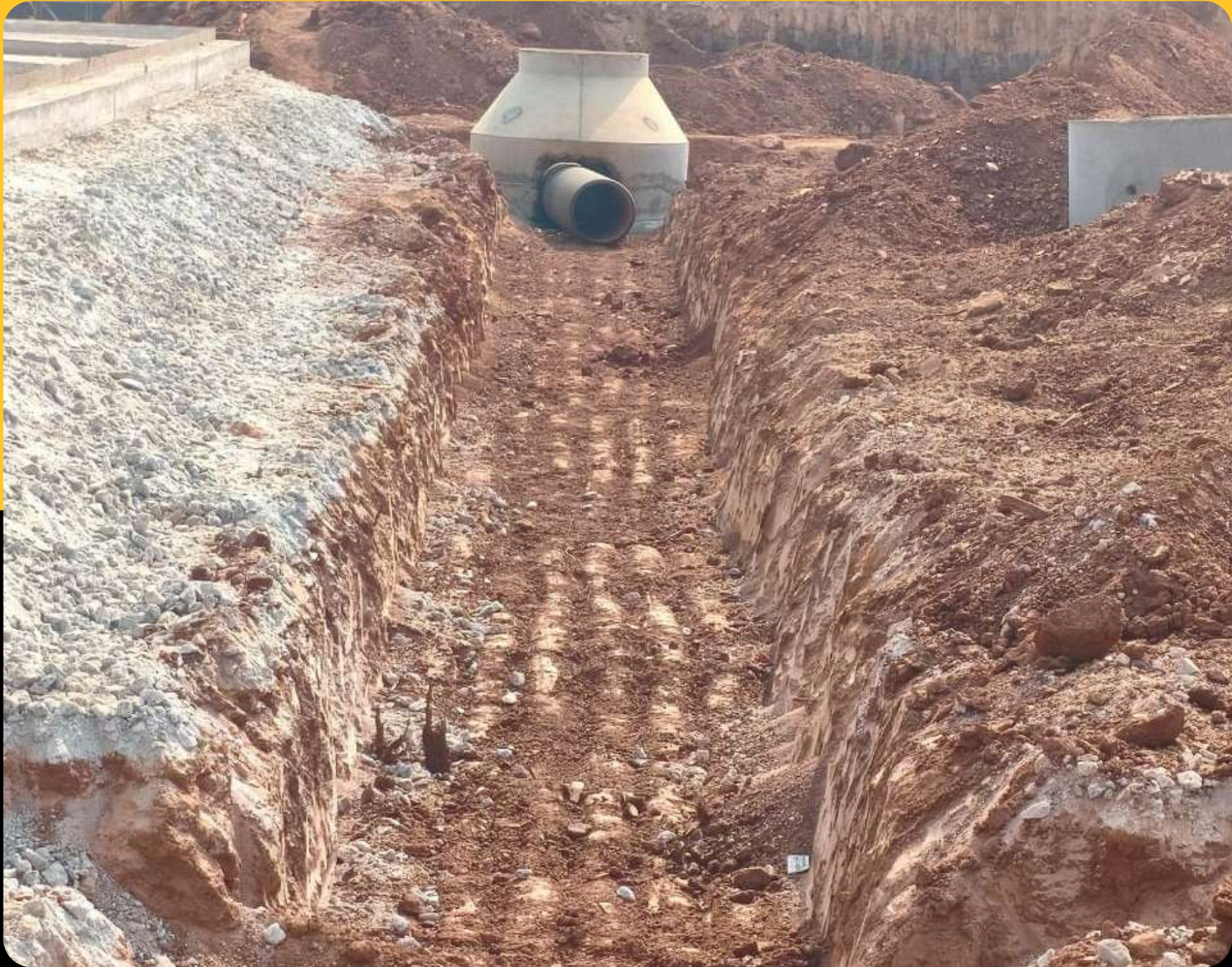
Chamber connection dwc pipe exhibition work