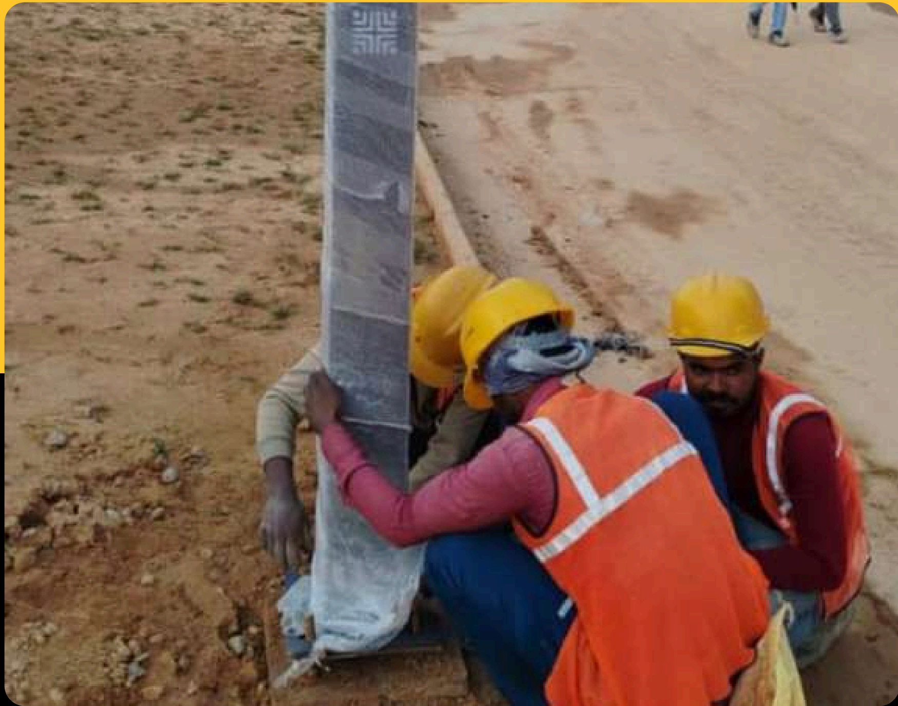
Street light fixing work