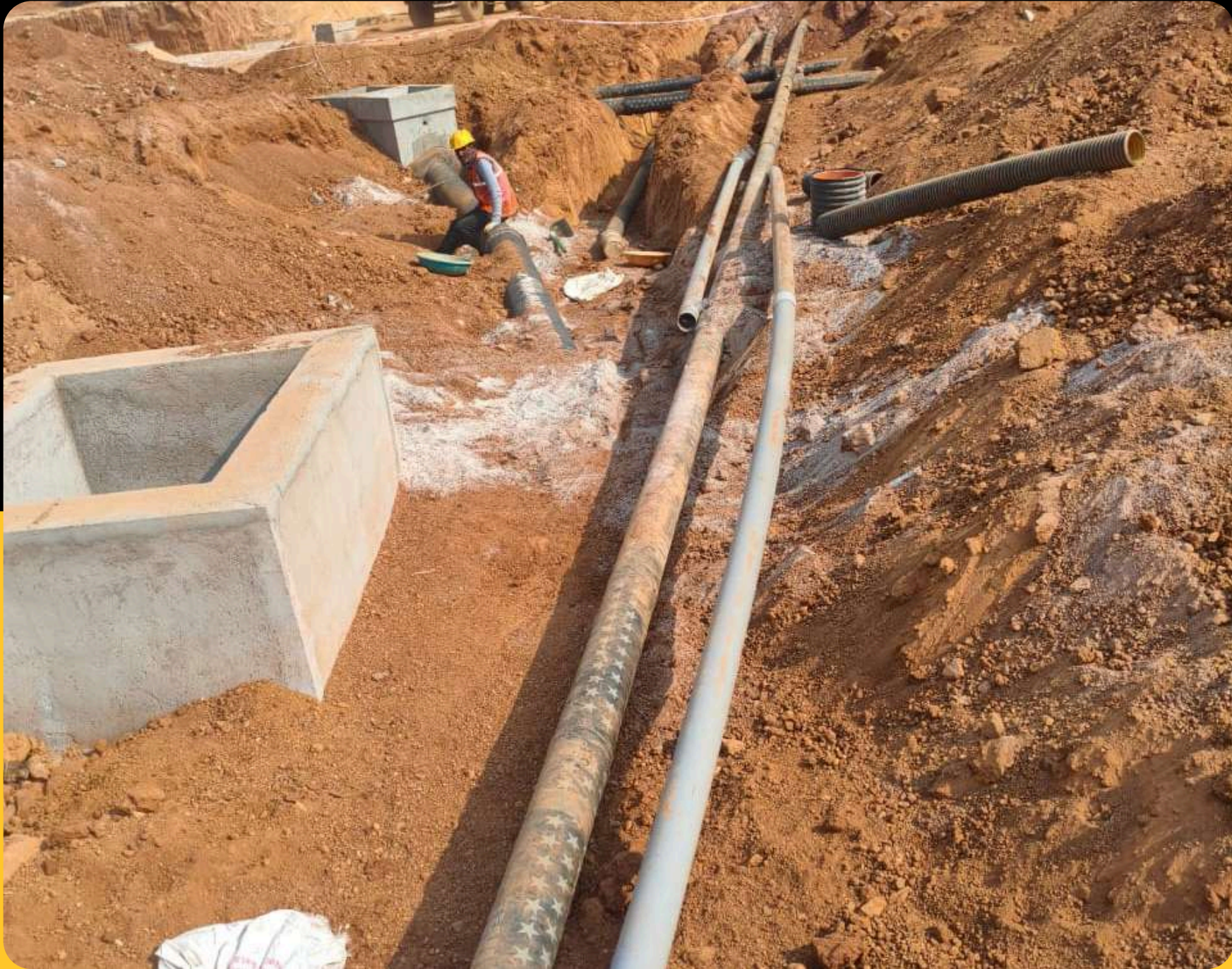
Road train pipe laying work