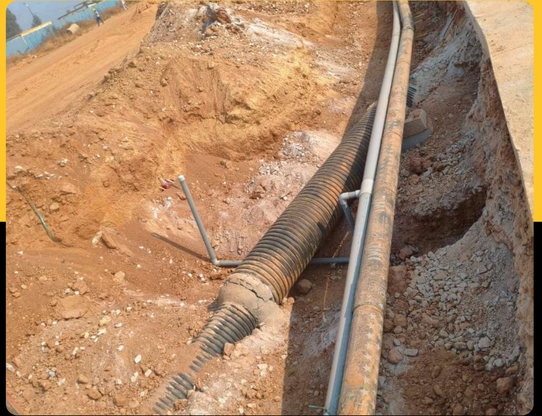
JC line to sprinkler pipe work