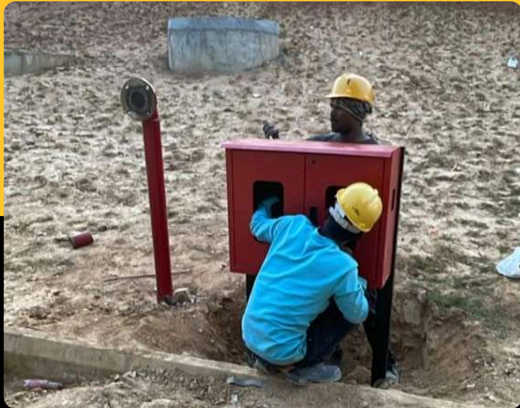
Fire line hose box fixing work