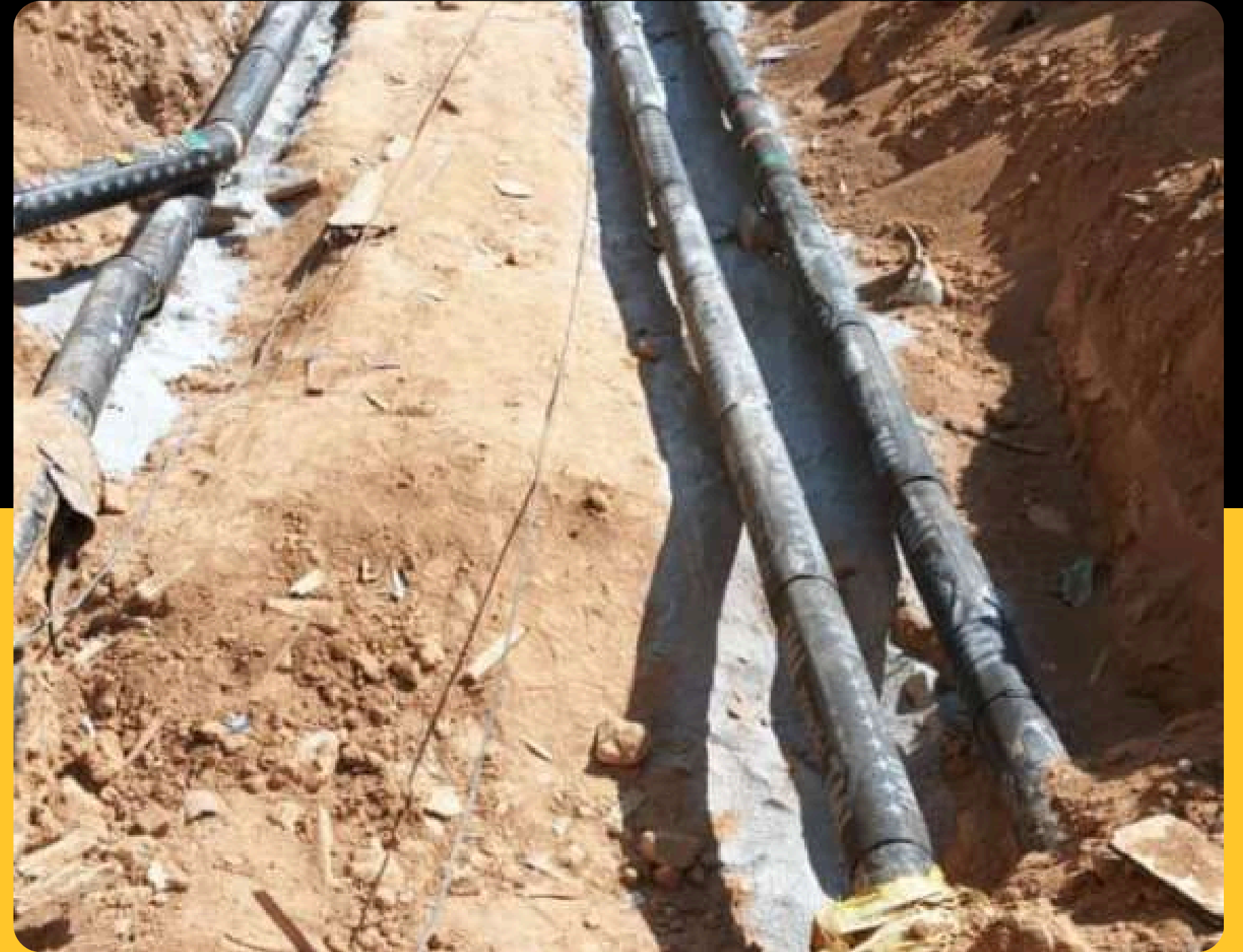
Water line 1x , j line, z b line, X line