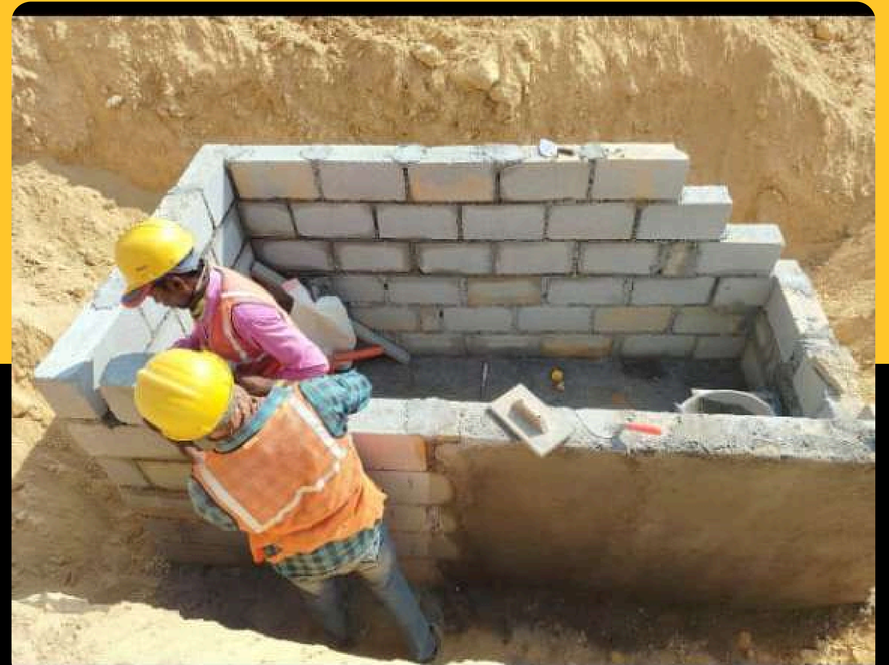
Rectangle solid brick chamber work