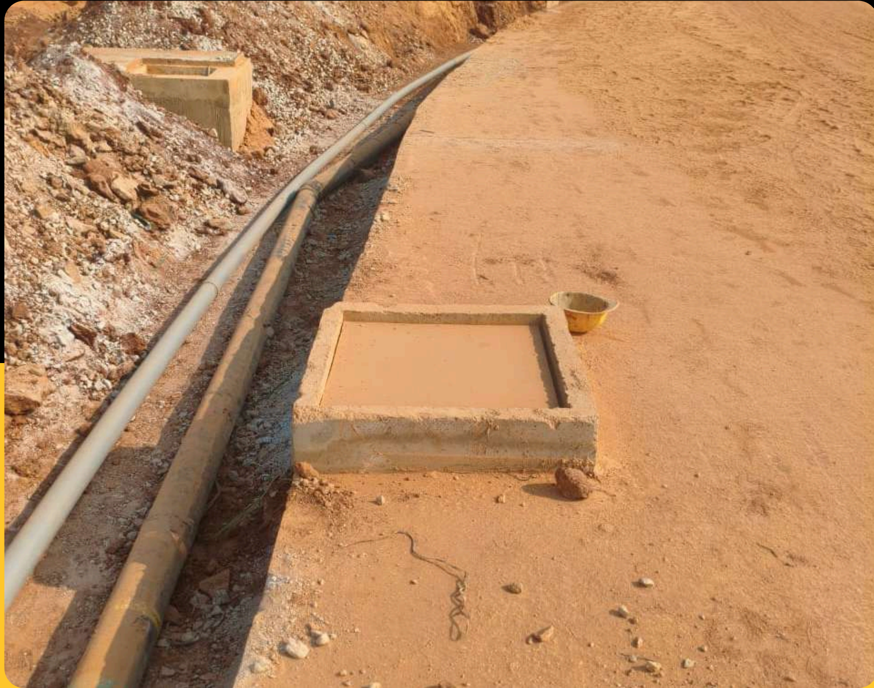
Road rain chamber leveling from road