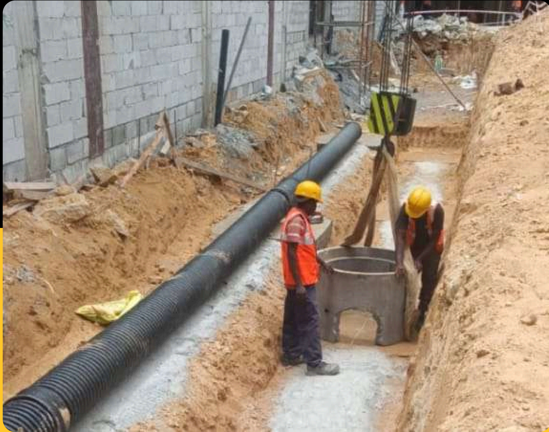
Sewage line H1 installation work