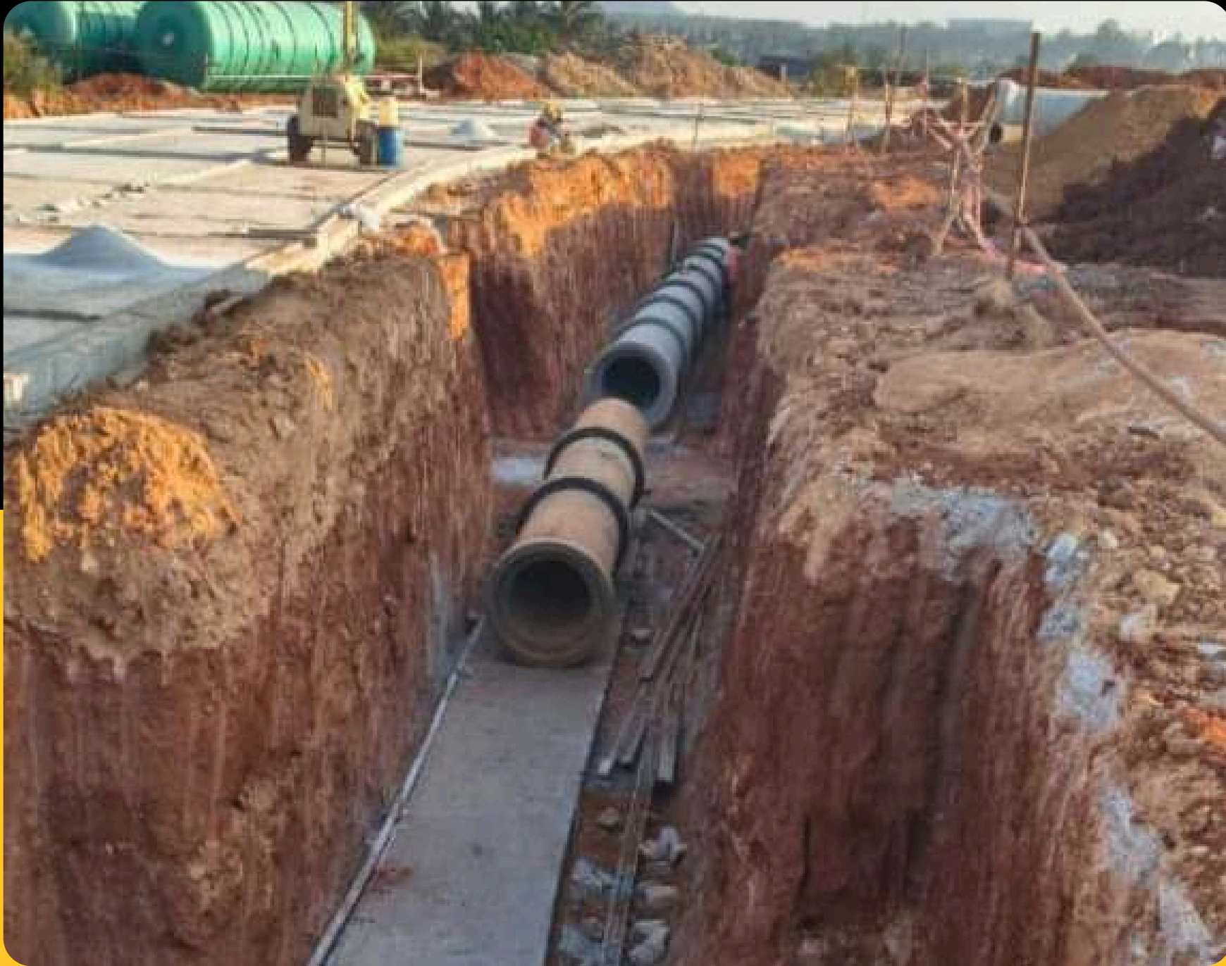
Rainwater main line piping work