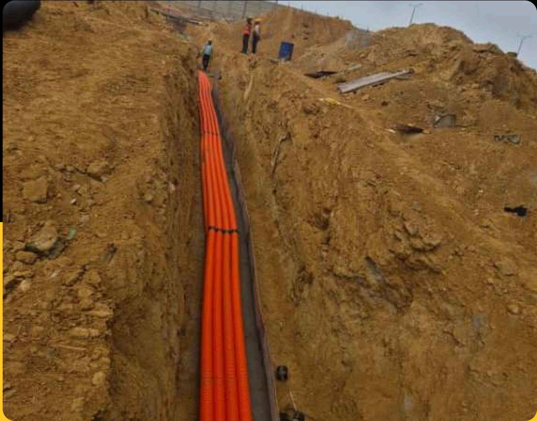
Internet and CCTV camera pipeline work