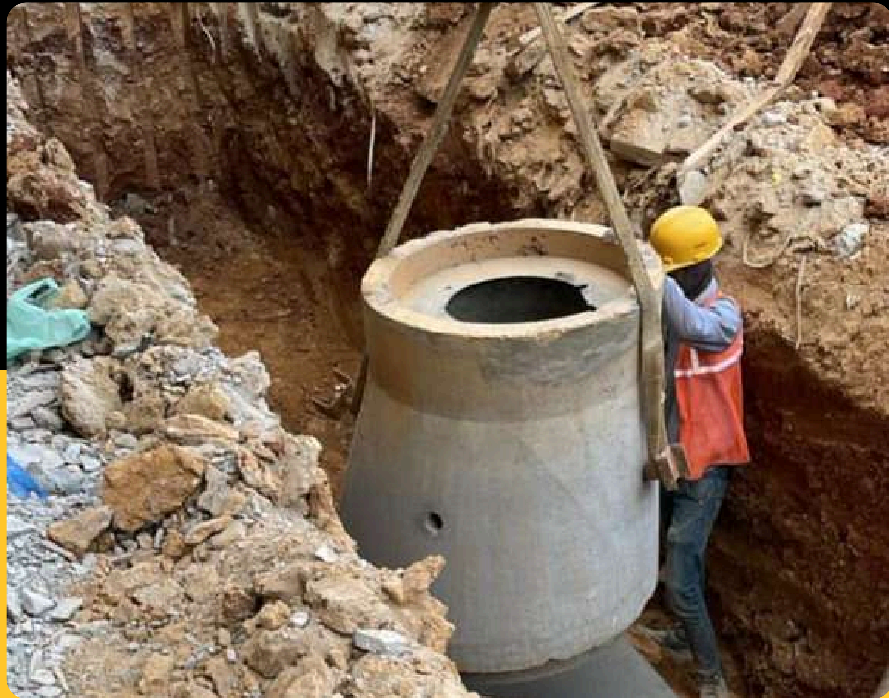
Building inlet savage line connection gone installation