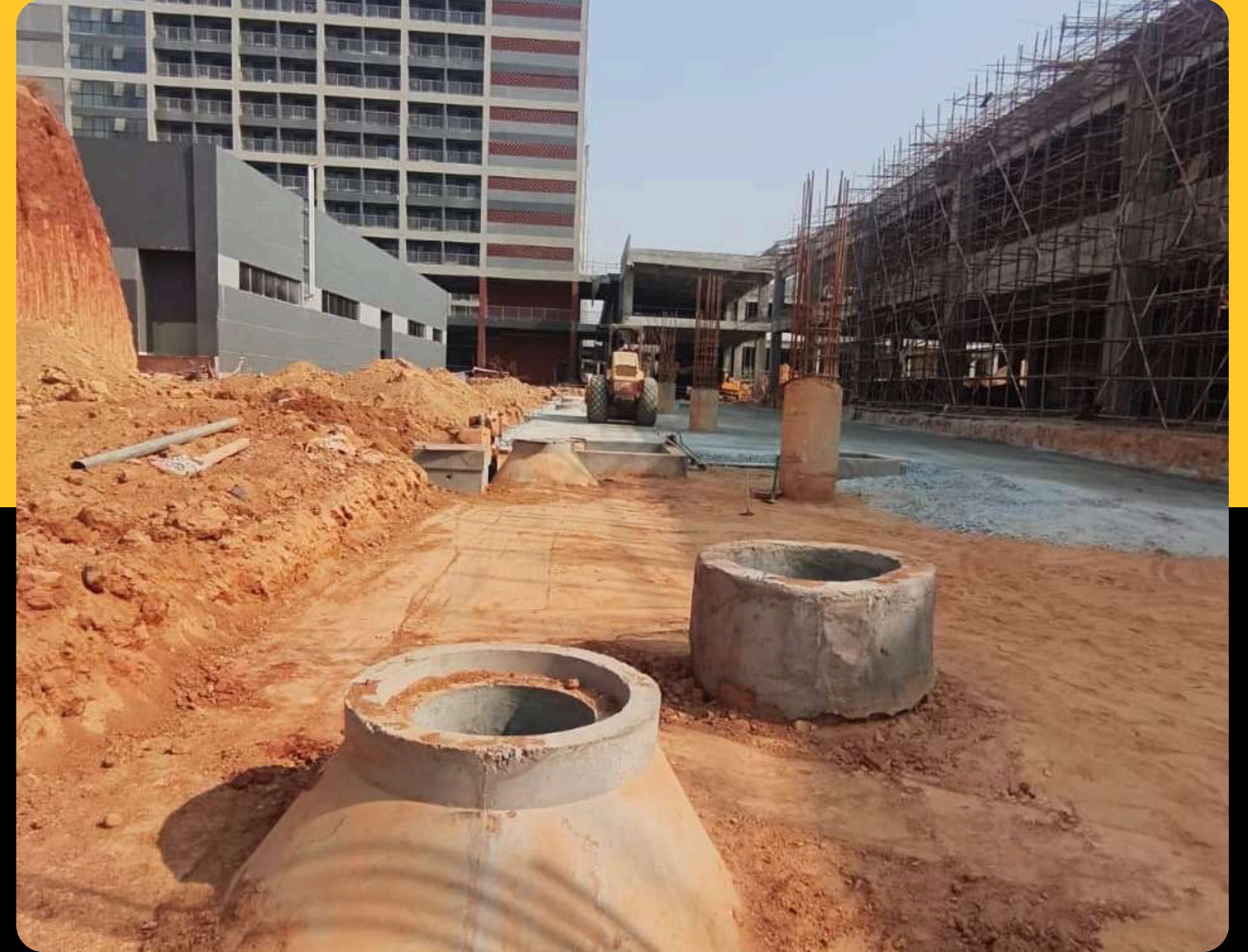
Road level and chamber level checking work