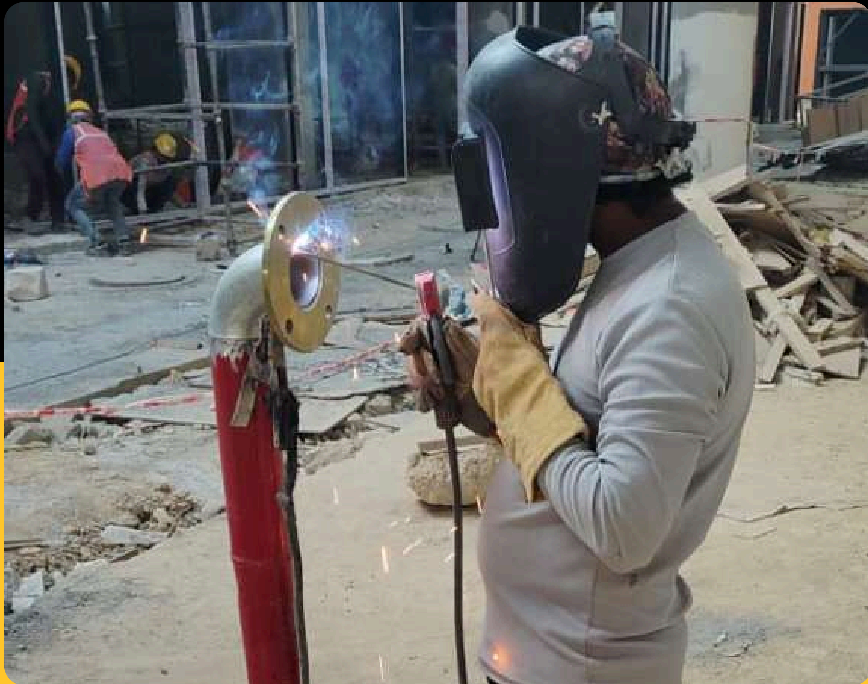
Fire hydran wall planche welding work