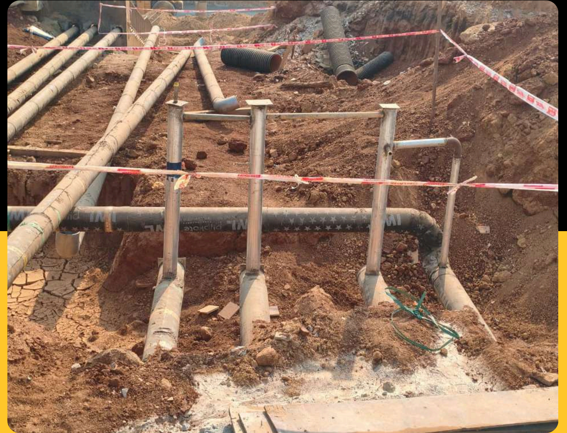
Pressure testing line work